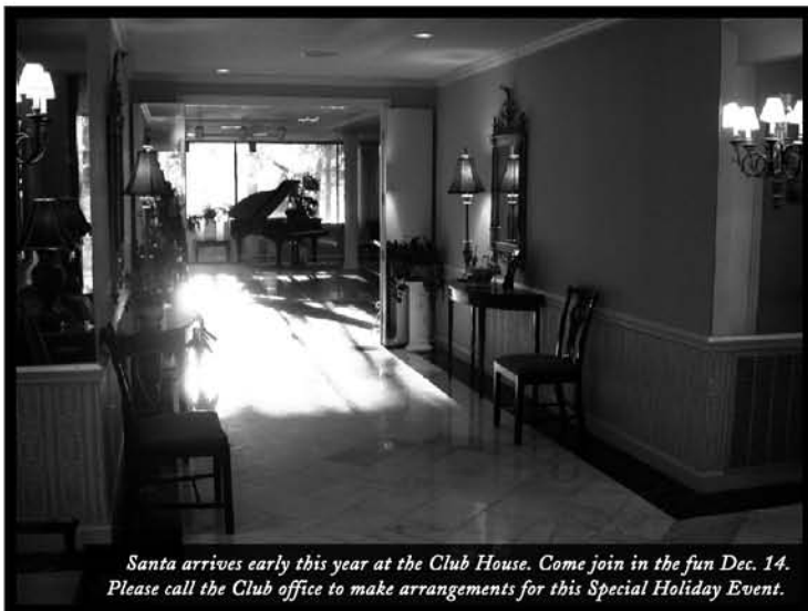
Santa arrives early this year at the Club House. Come join in the fun Dec. 14. Please call the Club office to make arrangements for this Special Holiday Event.

Please call the Club office to make arrangements for this Special Holiday Event.