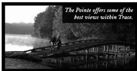
The Pointe offers some of the best views within Trace.