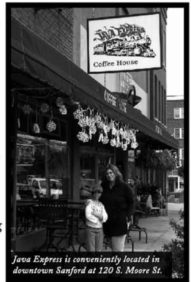
Java Express is conveniently located in downtown Sanford at 120 S. Moore St.