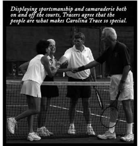
Displaying sportsmanship and camaraderie both on and off the courts, Tracers agree that the people are what makes Carolina Trace so special.

So, as we create our new marketing approaches to bring new people through our gates, we ask you to tell us your stories about the people at Trace. We know...you could "write a mini-novel" about all of the nice things that people do but we are not writing a book. We are, however, collecting these specific stories to weave into the messages we send out to tell people what is so special about Carolina Trace.