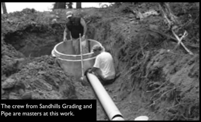
The crew from Sandhills Grading and Pipe are masters at this work.

We told you the sewer and water would be installed: