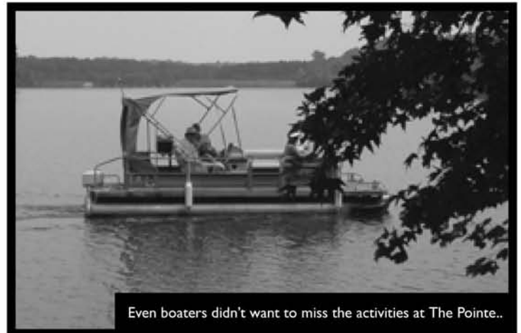
Even boaters didn't want to miss the activities at The Pointe..